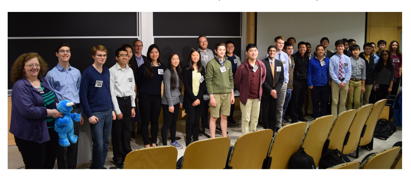
PRIMES students at the Eighth Annual PRIMES conference at MIT, May 2018

MIT PROGRAM FOR RESEARCH IN MATHEMATICS, ENGINEERING, AND SCIENCE FOR HIGH SCHOOL STUDENTS (WEB.MIT.EDU/PRIMES)