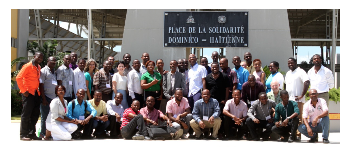
Figure 1: Group photo of the MIT-Haiti Initiative Workshop at SHCL in August, 2015.

One of our principal objectives was to contribute what we could to the formation of a community of educators with a common experience and approach. The high number of returning participants suggested that we have had some success in this. See Figure 1.