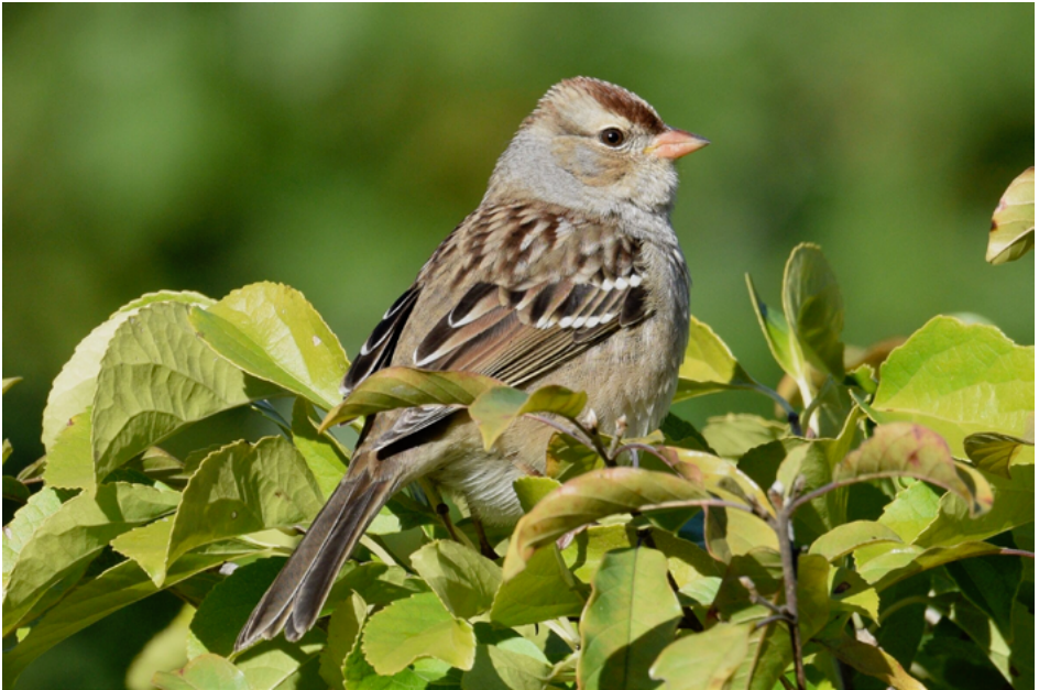
White-crowned Sparrow, Oct 14, 2016.

three alternative routes; see < https://www.mbta.com/schedules/52/line >. The easiest route to access Nahanton Park is via Winchester Street, with a bus stop at Goddard Street (outbound) or Rachel Road (inbound). Walk east along Winchester Street, and the park entrance will be on your right.