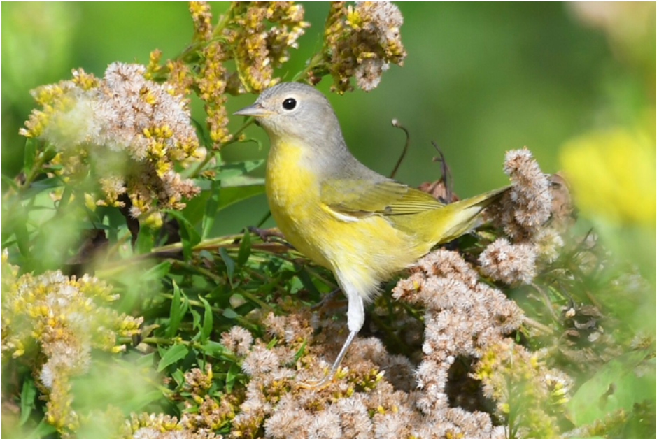
Nashville Warbler, Sept 14, 2017

wheelchair accessible pathway that extends along the river to the parking area for the Nature Center. Prothonotary Warbler has been observed here in May 2005 and May 2014.