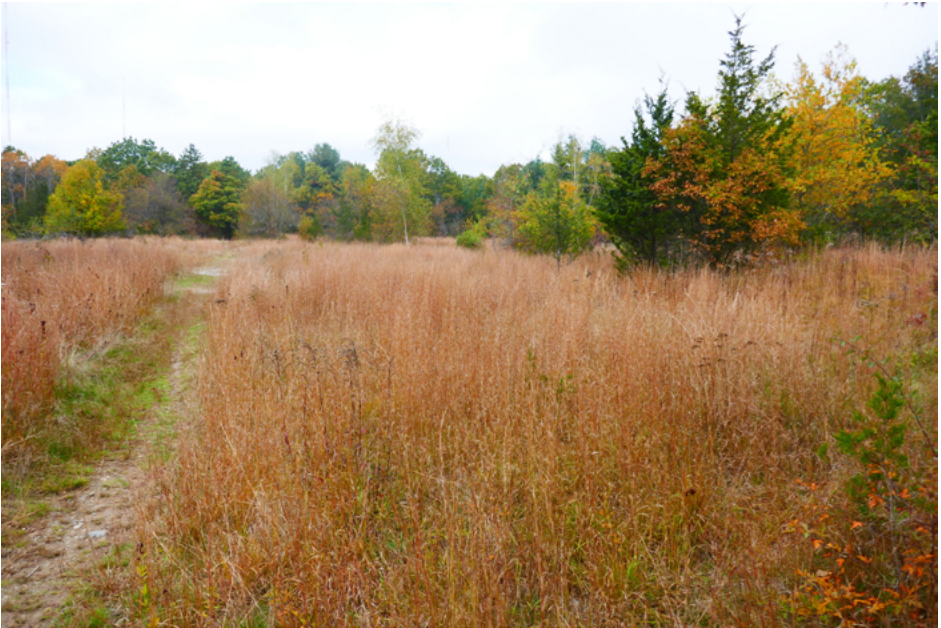
Woodcock Field, Oct 23, 2017.

Continuing along the trail, you'll come out to the Charles River. Charles River Canoe and Kayak has an active rental center here in the summer. Turning right at the river takes you along Florrie's Path; this can be good for migrating fall warblers, such as Blue-winged. Common Yellowthroat, Warbling Vireo, and Blue-gray Gnatcatcher breed along the river, and in 2018 Black-billed Cuckoo nested here. In May 2017, a Gray-cheeked Thrush was observed by many on Florrie's Path and in the parking circle in front of the Nature Center.